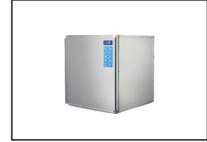
T304 Stainless Steel Panels