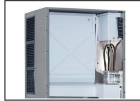
Vertical Cube System