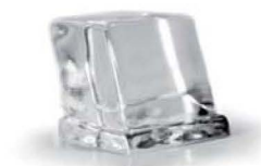
Full Cube - 12 G (26,5 x 26,5 x 26 mm)