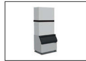
Double Stack (Needs a stacking kit sold separately)