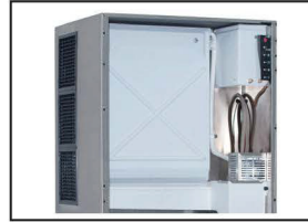
Vertical Cube System