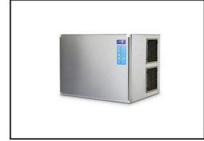
T304 Stainless Steel Panels